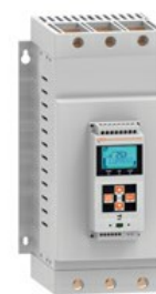
Soft starter ADXL Asynchronous three phase

Product designation Product type designation Motor type