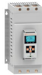
Soft starter ADXL Asynchronous three phase

Product designation Product type designation Motor type