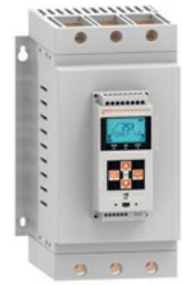
Soft starter ADXL Asynchronous three phase

Product designation Product type designation Motor type