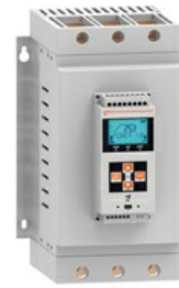
Soft starter ADXL Asynchronous three phase

Product designation Product type designation Motor type