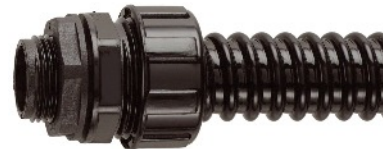
FPC Conduit with MPC fitting