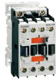
Power contactor BF09