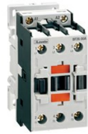
Power contactor BF26