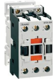
Power contactor BF32