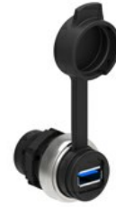
USB interface, A/A female type connection LPCD0